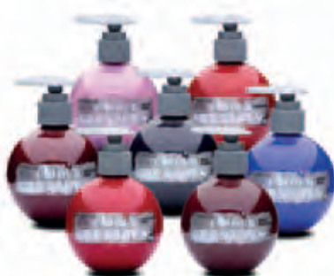
Colour Grenades 200ml Bottles – 7 colours