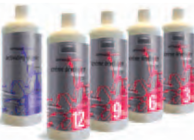
Infiniti Satin Activating Creme 950ml